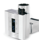
Modello Elettrico Electric Model

Ordering example: 85000070050 W0 = mod. Windsor, height 798 mm x width 500 mm, Satin stainless steel.