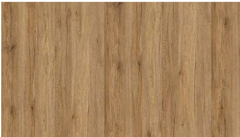
ROVERE RUSTICO /RUSTIC OAK