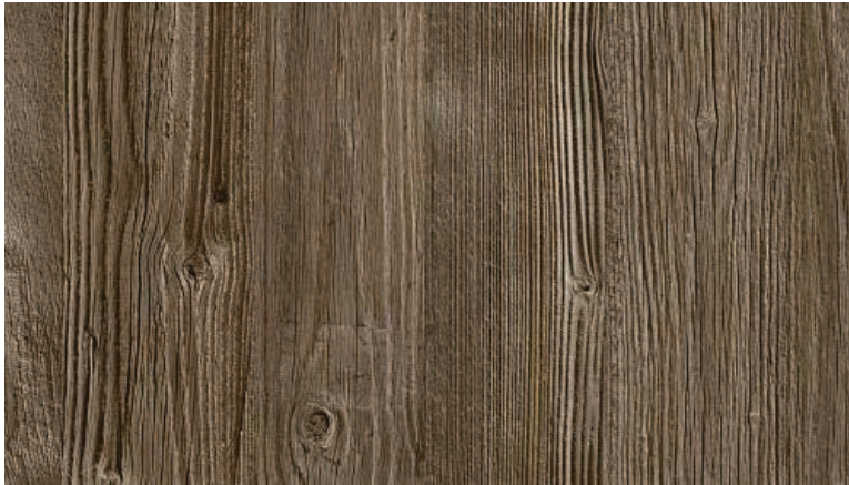
ABETE SCURO /SPRUCE

FINITURE CASSETTO E PIANI / FINISHES DRAWER AND SHELVES